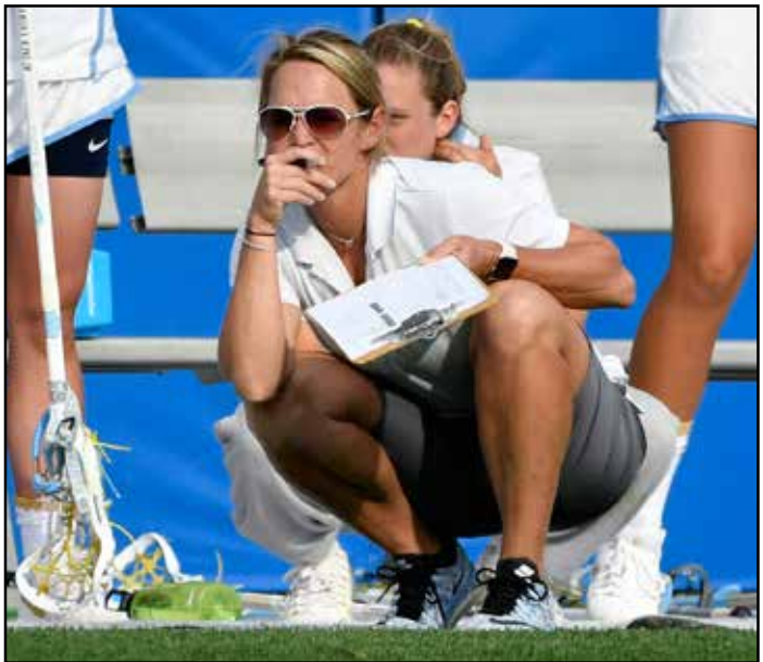
Heel program from scratch.