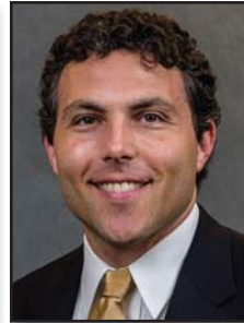
Josh Pastner Head Coach